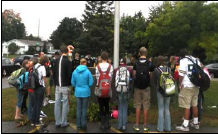
Students gather for prayer at the flag pole, September 28th at Memorial High School in Eau Claire.

This was the 21st anniversary for See You at the Pole, a student-initiated and student-led movement. Since 1991, See You at the Pole has grown to God-sized proportions. More than 3 million students from around the world participated this year in See You at the Pole. In places like Canada, Korea, Japan, Turkey, and the Ivory Coast, students are responding to God and taking seriously the challenge to pray. And what an encouragement it was for me to see so many students, especially those from Bethesda, standing together and praying on Sept. 28th! SYATP brings students to their school flagpoles to intercede for their leaders, schools, and families, asking God to bring moral and spiritual awakening to their campuses and countries. Change is only going to happen by us first humbling ourselves and asking God to do his work, and so to see our students stand out and stand up to pray at their school is an awesome thing!